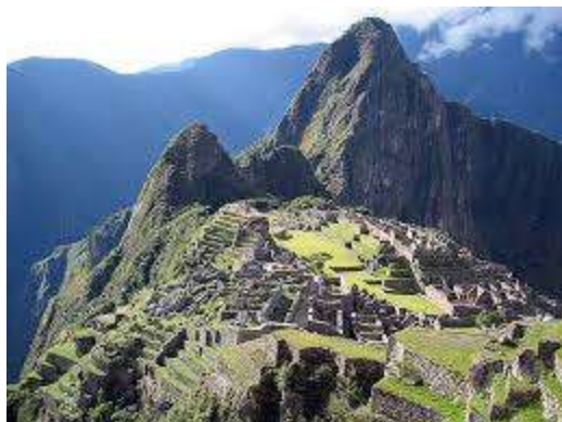
"Classic Inca Trail, The Most Famous of Peru Hiking Adventures." Classic Inca Trail, The Most Famous of Peru Hiking Adventures . N.p., n.d. Web. 18 June 2014.