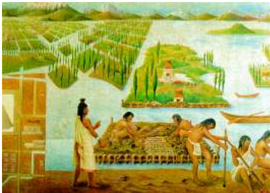
"Chinampa: Raised-bed Hydrological Agriculture." Anthropogen . N.p., n.d. Web. 18 June 2014.

The swamp provided wild plants, fish, frogs and ducks to eat. Agriculture was the basis of the Aztec civilization. To expand their opportunities to farm, the Aztec built floating gardens called chinampas , where they grew corn, avocados, beans, chili peppers, squash and tomatoes.