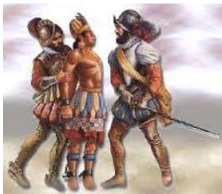
"La Captura De Atahualpa." LA CAPTURA DE ATAHUALPA POR FRANCISCO PIZARRO HISTORIA DEL PERU ADONDE.COM . N.p., n.d. Web. 18 June 2014.

The Incas were polytheistic and their central god was the sun-god. Human sacrifices were routinely made to please the god (pay tribute). The Inca empire came to an end in 1530s when Francisco Pizarro confidence the Inca emperor, Atahualpa to meet with him. Pizarro kidnapped him and he tried to buy his freedom, but was executed in 1533.