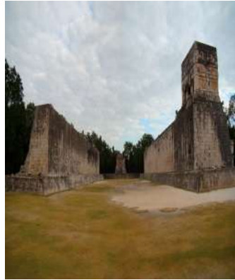
Aztecs, Maya, and Inca." History for Kids . N.p., n.d. Web. 16 June 2014.

Question: What type of architectural structure was found in both Mesoamerica and the eastern hemisphere?