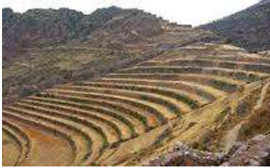
"Aztec Farming." Aztec Farming . N.p., n.d. Web. 18 June 2014.