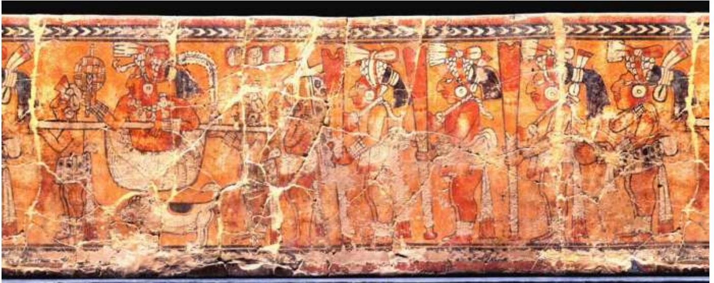
"Mesoamerican Art & The "Horse" Controversy." Lehis Library . N.p., n.d. Web. 18 June 2014.

The Mesoamerican culture was developed in ways similar to and different from those in the other parts of the world. This culture also influenced the development of the rest of the world and is enduring and evident in our society today.