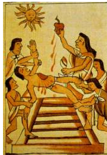
"Aztec Sacrifice." Aztec Sacrifice . N.p., n.d. Web. 16 June 2014.