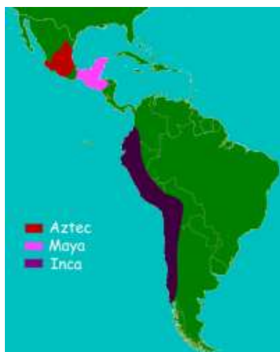
"Aztecs, Maya, and Inca." History for Kids . N.p., n.d. Web. 16 June 2014.

For more than 1100 years three separate, but similar civilizations flourished in Central and South America. These civilizations were the Mayans , Aztec , and Incas . Farming led to the growth of these civilizations. Growing corn and other crops created a change from hunter-gatherer societies to more complex, settled societies. All three civilizations were geographically isolated and left little culture behind, they were all advanced civilizations.