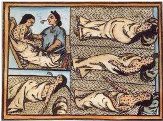
"In the Western World... and Australia." In the Western World... and Australia N.p., n.d. Web. 18 June 2014.

The decline of the Aztec civilization came when Montezuma, the Aztec emperor, was defeated by the Spanish conquistador, Hernan Cortez in 1521 AD. Diseases such as smallpox and measles also decreased the population of the Aztecs because they had no natural immunities.