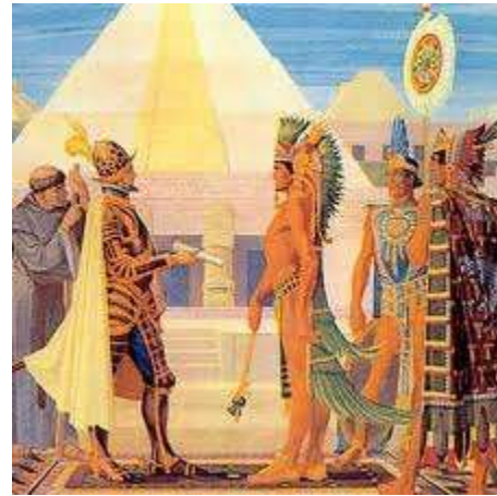
"Aztec - Google Search." Aztec - Google Search . N.p., n.d. Web. 18 June 2014.

Question: How could disease cause an empire to decline?