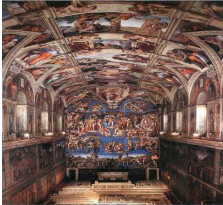
The Sistine Chapel

http://www.lib-art.com/imgpainting/2/5/14052-interior-of-the-sistine-chapel-michelangelo-buonarroti.jpg