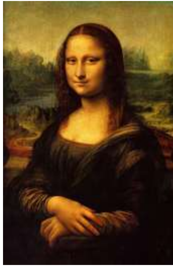
The Mona Lisa

http://www.pbs.org/treasuresoftheworld/mona_lisa/images/mona_page_pix/mona_large.jpg