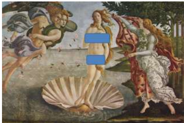
The Birth of Venus

Sandro Botticelli was another painter from Florence. He is famous for the painting The Birth of Venus , seen below. Botticelli used Greek, Roman, and Christian themes in his artwork.