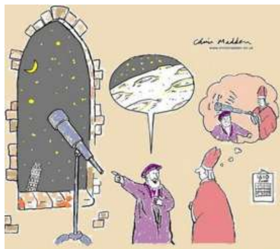
Galileo discusses his discoveries with the Church

During the Renaissance, this new way of thinking sparked a renewal in science as well. Ideas in astronomy, anatomy , medicine, and physics advanced to new levels. However, these sciences came into conflict with accepted teachings of the Roman Catholic Church. Scientists such as Johannes Kepler , Nicolas Copernicus , and Sir Isaac Newton all discovered scientific laws and theories that directly challenged traditional Church beliefs. These men provided the basis for modern science.